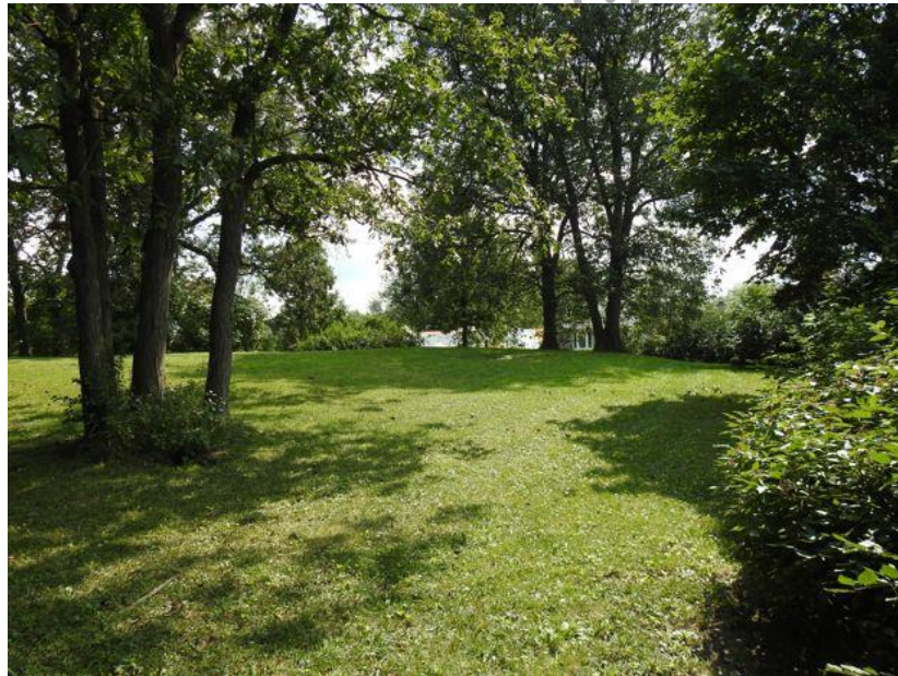
View of the cemetery