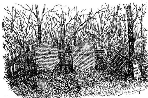
IN THE DESERTED GRAVEYARD.