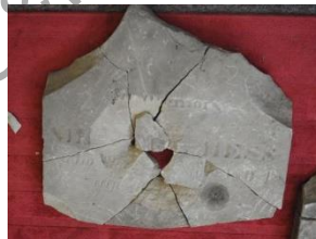
Michael Hess's gravestone