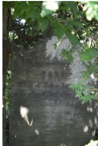
Jane Snider's gravestone

The stump of a stone remains in the middle of a clump of bushes, near the previous location of the Hess stones. While it is impossible to determine whose gravestone this is, the remaining shape would suggest that it was part of Charity's gravestone.