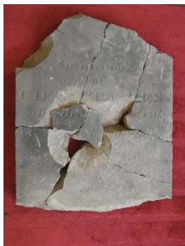
Charity Hess's gravestone

Michael, Charity, and Jacob Hess's gravestones are carefully preserved in the non-functional fireplace in the Fireside Room of the Church. In August 2017 the pieces were sorted and the gravestones were assembled and photographed. Charts were made showing the layouts of the pieces and the pieces were labelled on the charts and on the backs of the pieces to facilitate future reassembly. The pieces were then placed back in the fireplace, with individual gravestones being separated by cardboard. The charts will be placed on top of the gravestones. The eventual plan is to secure the gravestones behind a door enclosing the opening of the fireplace.