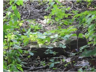
Partial gravestone

Michael, Charity, and Jacob Hess's gravestones are carefully preserved in the non-functional fireplace in the Fireside Room of the Church. In August 2017 the pieces were sorted and the gravestones were assembled and photographed. Charts were made showing the layouts of the pieces and the pieces were labelled on the charts and on the backs of the pieces to facilitate future reassembly. The pieces were then placed back in the fireplace, with individual gravestones being separated by cardboard. The charts will be placed on top of the gravestones. The eventual plan is to secure the gravestones behind a door enclosing the opening of the fireplace.