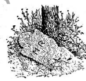
Illustrations of the gravestones in 1897 6

According to a report published by the Ontario Genealogical Society in 1988 the Hess Family Burial Grounds (CEM 312/MIS 032) may at one time have contained over 200 burials. 7 No records are available to substantiate this however. It is distinctly possible that the number 200 refers to the men who died of wounds and disease at the Union Church which was used as a hospital during the War of 1812, and who are said to have been buried in the churchyard. 8 This churchyard, which is located on the north side of Mohawk Road about 0.5 km from the Hess Cemetery, is now known as St. Peter's Cemetery. It replaced the Hess Cemetery.